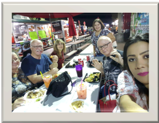
Itazuke Alumni meet Nov 2017 in FL

Would you attend the farewell breakfast on Sunday, October 7? 53% (60) said YES